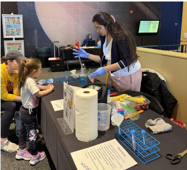
On February 28, 2026, Drake University students representing the Drake Undergraduate Science Collaborative Institute (DUSCI) and Arts & Sciences volunteered at the Girls in Science Festival at the Science Center of Iowa. The event welcomed more than 1,600 visitors for a day of interactive STEM activities.