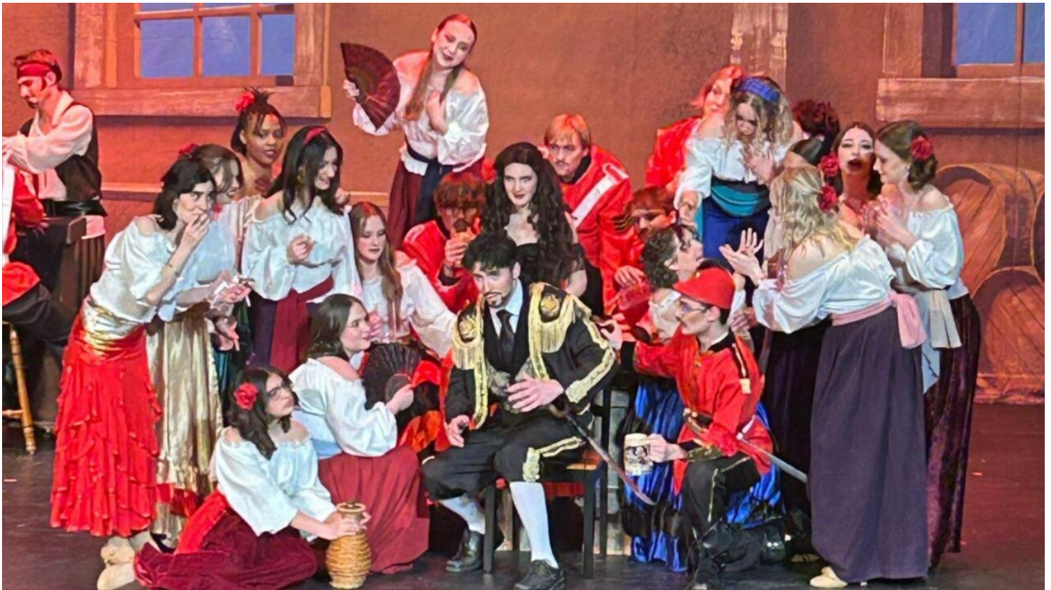
from Drake Opera Theatre's Production of Carmen.